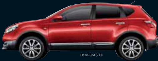
Flame Red (Z10)