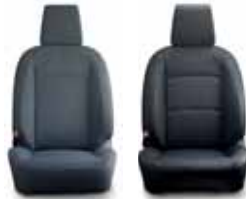
Interior cloth seat trim - ST.