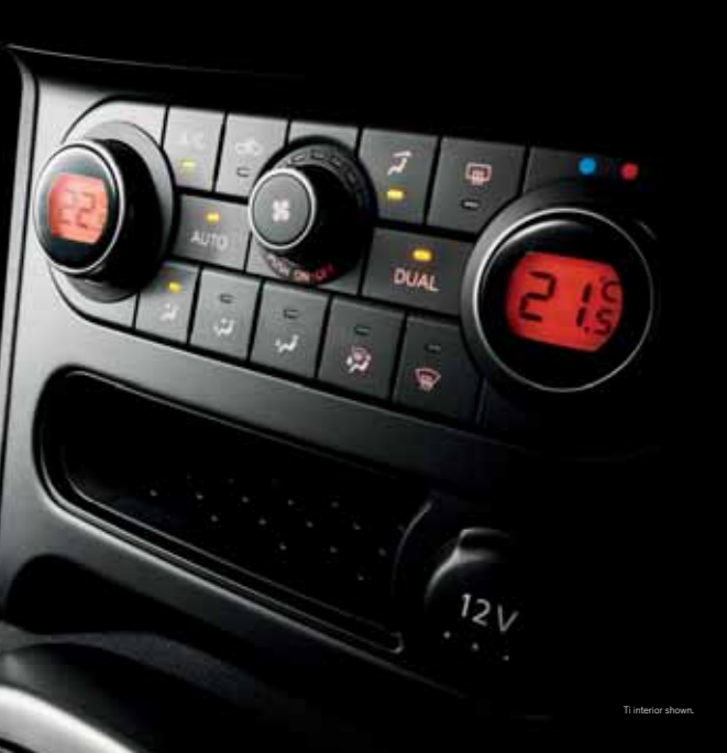
Ti interior shown.