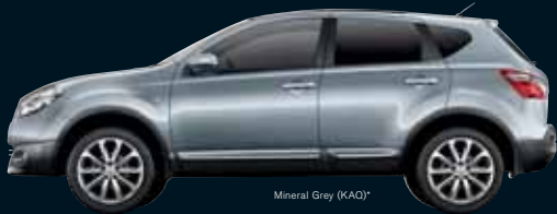
Mineral Grey (KAQ)*