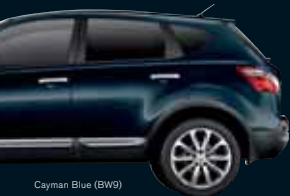
Cayman Blue (BW9)