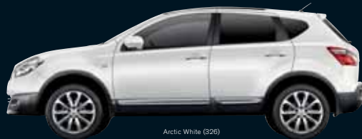
Arctic White (326)