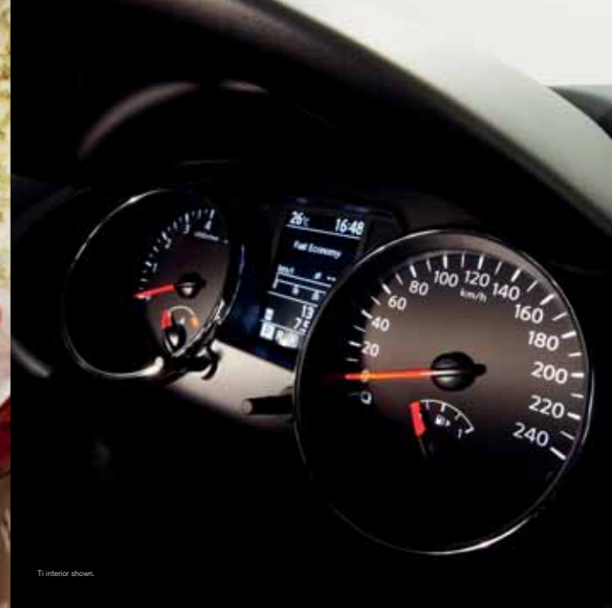
Ti interior shown.