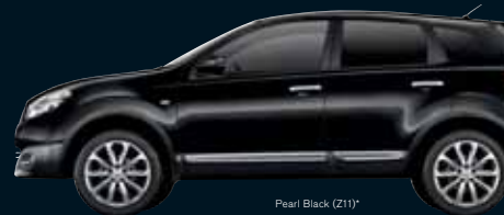
Pearl Black (Z11)*

In some cases the printed colours may vary from the actual paint colours. *Indicates a metallic paint, which is available at extra cost.