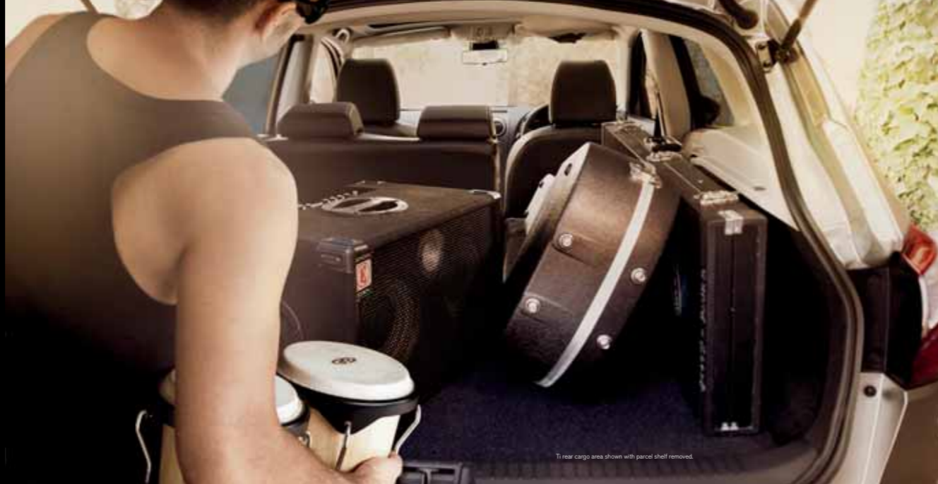
Ti rear cargo area shown with parcel shelf removed.